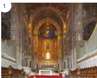
1 Monreale Cathedral

Palermo, the island's capital, is one of those intriguing cities of extremes. Graceful palazzi and villas from an era long since past contrast dramatically with modern flats and apartments. The Palace of the Normans - an imposing 12th century cathedral, the gardens of the Villa Giulia, the superb archaeological museum and the eerie yet fascinating catacombs should not be missed.